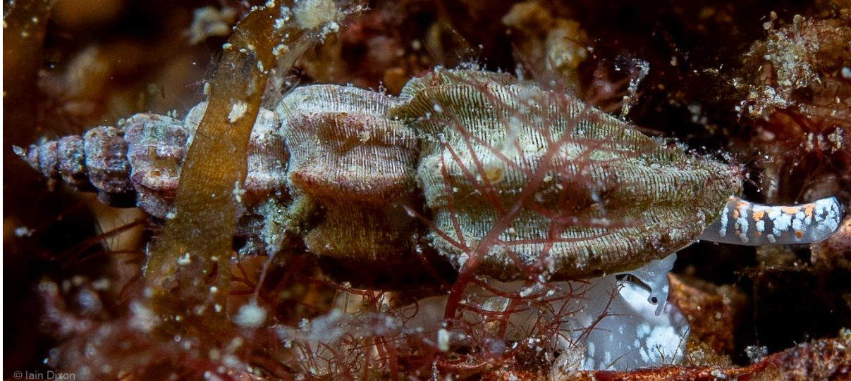
Fig.7. Smithiella costulata (Risso, 1826) off the north coast of Skye.

schemes (e.g. Seasearch, Porcupine) to help determine and verify identification. It can reveal some gems, such as the Smithiella costulata (Risso, 1826) – formerly placed in the genus Mangelia Risso, 1826 and familiar to many from Graham (1988) as Cytharella smithi (Forbes, 1844) – photographed by Iain Dixon and shared in the ‘Seasearch Identifications’ group (Fig.7). One just hopes that the accessibility and proliferation of online groups will not ultimately see the demise of societies such as ours.