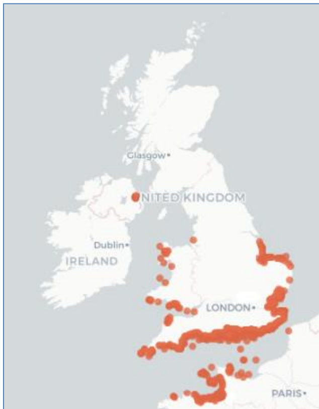
Fig.6. The Society's records of Crepidula fornicata (L., 1758) prior to recent discoveries in NE Scotland.