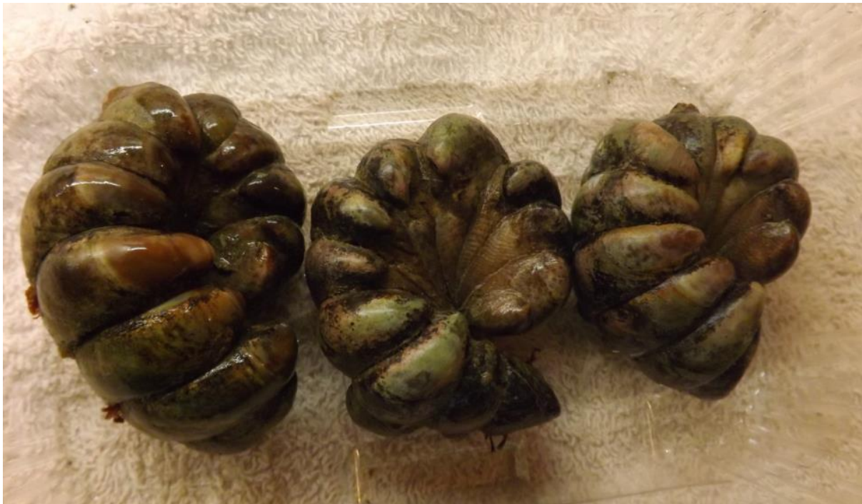
Fig.5. Arched stacks of Crepidula fornicata (L., 1758) Mersea Island, Essex..