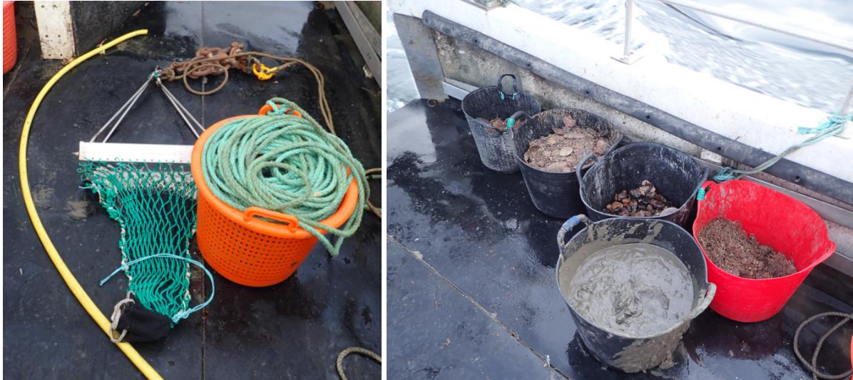
Fig.8. (left) the dredge ready for launch off Kylesku and (right) a diverse haul of samples.