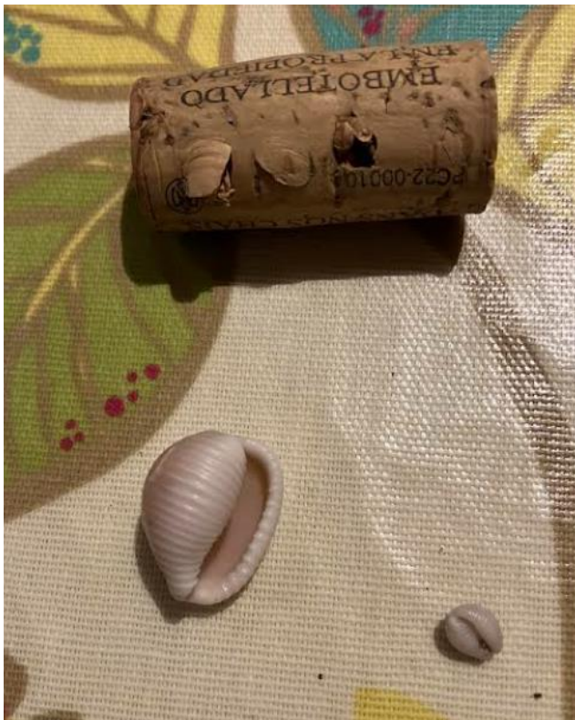
Fig.9. Triviella cf. aperta (Swainson, 1822), near Trevoze Head, north Cornwall.

As seems to be the case almost every year now, there were intriguing reports received of adventive finds. During the summer, Christopher Smart made contact regarding an unusual shell he had found near Trevoze Head, north Cornwall. He regularly collects specimens of the native Trivia species around the Cornish coast and immediately recognised the difference in a pink specimen measuring 30mm in length, tentatively identifying it as a Triviella aperta (Swainson, 1822). Looking at the images of the specimen (Fig.9) that determination seems reasonable, other than the fact that it is a South African species. As with the majority of these adventives, it is only possible to speculate as to the its provenance.