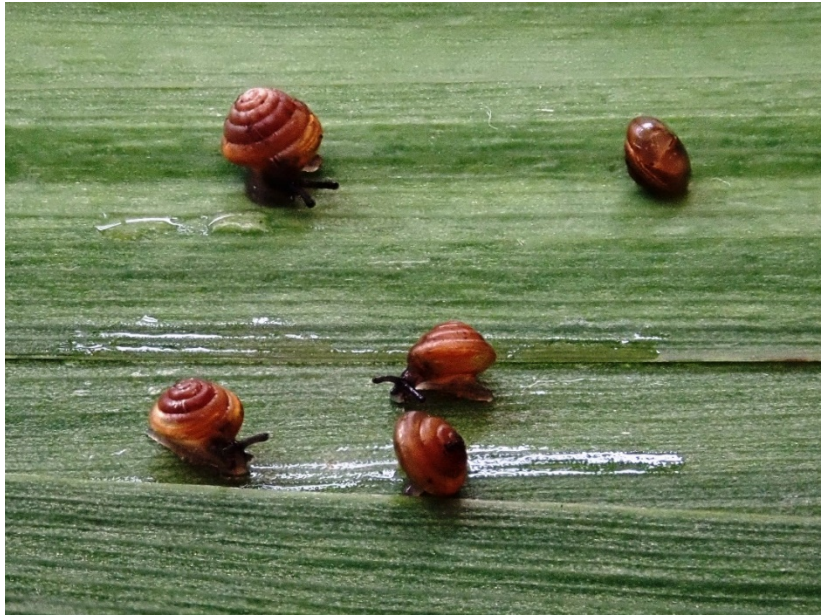
Fig. 1. Tawny Glass Snails ( Euconulus fulvus ) with unusually dark bodies, from Duns, Berwickshire.