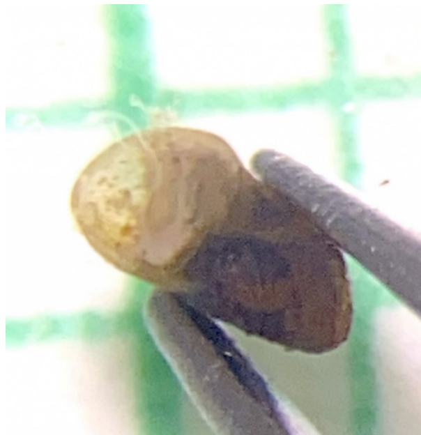
Fig. 3. Trumpet Ram's-horn ( Menetus dilatatus) from Frittenden, Kent.

noting that four of the new VC records came via iRecord (one of them via iNaturalist) which shows how useful these sources can be to the Scheme.