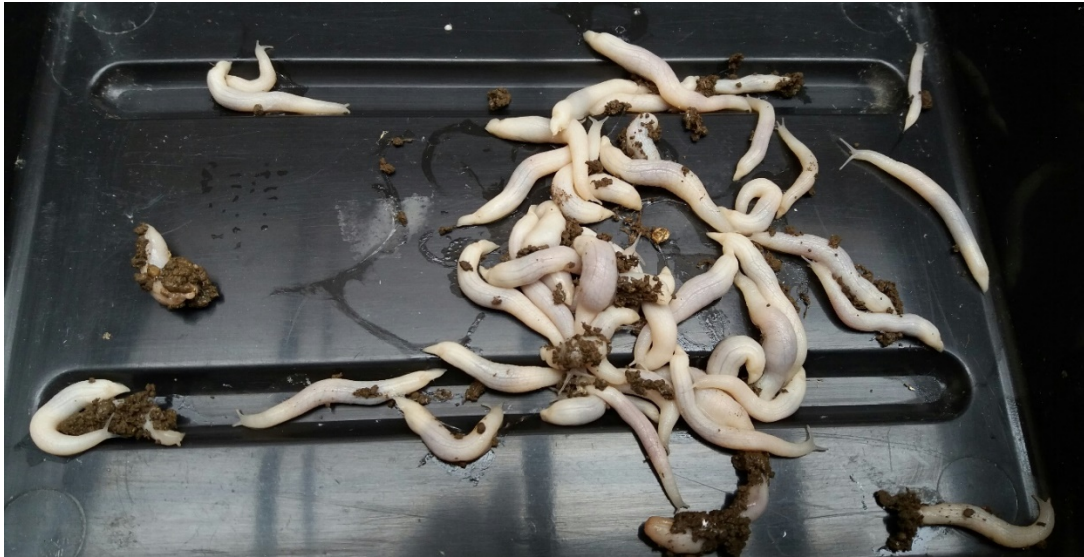
Fig. 4. A host of Ghost Slugs ( Selenochlamys ysbryda ) from Dursley, West Gloucestershire.

Finally, Martin Willing returned to survey the River Ouse, East Sussex, near which dead shells of the Asian Clam ( Corbicula fluminea ) were first found in 2020. Live C. fluminea were found over 8.5 km of the tidal stretch, in places reaching densities of 600 m -2 . Size-frequency analysis suggests that the species first arrived between 6-10 years ago. Fortuitously, the survey also found living Depressed River Mussel ( Pseudanodonta complanata ) at two sites, these being the first records from the Ouse for over 50 years (Willing, 2022).