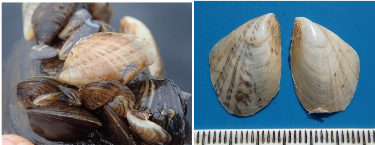
Fig. 2. Quagga Mussels ( Dreissena rostriformis bugensis ) from Lough Ree, western Ireland, showing the characteristic un-keeled ventral margin, and variable (sometimes asymmetrical) pattern on each valve.

predict that it will spread further. There were also two new VC records of D. polymorpha in Ireland, one from Lough Neagh (via iRecord) and the other from the Dublin Grand Canal (received thanks to Evelyn Moorkens).