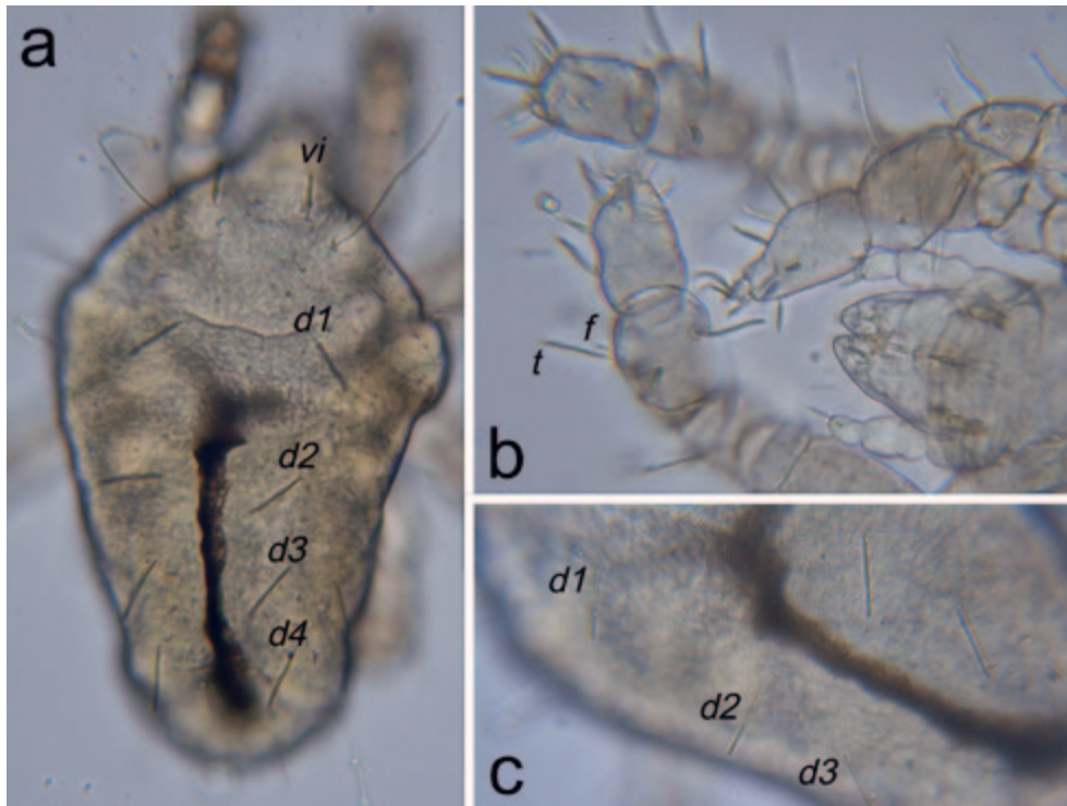
Figure 1 Identification features of Riccardoella limacum (the mite body is c. 0.4mm long): a dorsal view showing long thin dorsocentral setae d1-4 (pair d5 is not visible in this image, but is similar to the other setae) compared to shorter thicker anterior pair vi ; b leg I showing detail of the famulus ( f ) relative to its paired seta ( t ) on the tibia; c detail of dorsocentral setae.