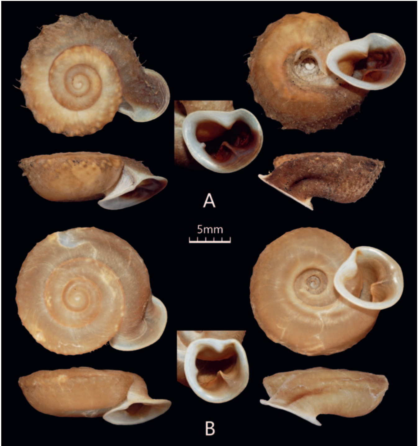
Figure 1 Photographs of two Moellendorffia species. A, Moellendorffia kuguaheshang sp. nov. (holotype, HBUMM10051, China, Guangxi Zhuang Autonomous Region, Nanning shi, Longan Xian, Dingdang Zhen). B, Moellendorffia qinglongi sp. nov. (holotype, HBUMM10052, China, Guangxi Zhuang Autonomous Region, Chongzuo Shi, Daxin Xian.).