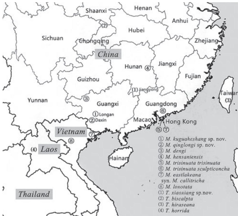
Figure 4 Distribution map of type localities of Moellendorffia and Trichelix species. New species, described within this paper, type localities are labelled as Moellendorffia kuguaheshang sp. nov.; Moellendorffia qinglongi sp. nov.; (1) Trichelix xiaoxiang sp. nov.

deep, approximately 1/5 of shell major diameter and through which the protoconch is visible.